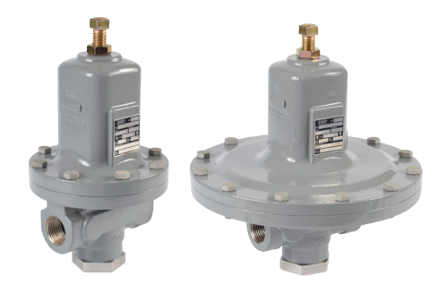
Fisher MR95H and MR95L Series Pressure Reducing Regulators

Fisher MR95 pressure reducing and MR98 backpressure, relief and differential relief regulators are compact, and provide a large turndown ratio and tight shutoff. They are highly configurable, with a broad range of trim options to meet a wide range of application needs, from pneumatic supply, to boiler feed water, to chemical processing. The easy maintenance design minimizes complexity and simplifies technician preventative maintenance requirements.