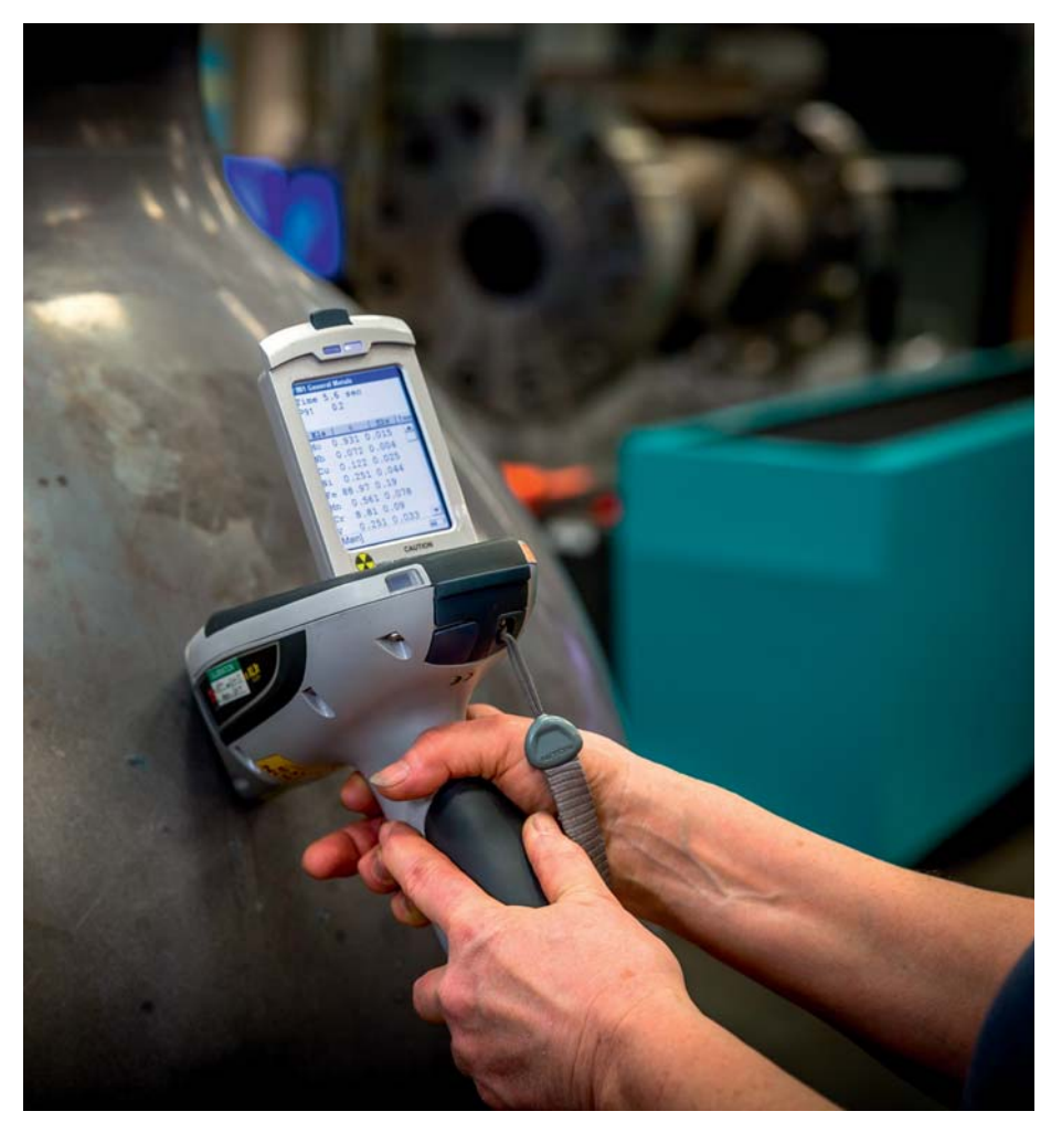
Figure 2. A PMI gun can identify the alloy being used in a valve part. Here, it is analyzing the valve body of a Fisher<sup>M</sup> valve.

Figure 1: Statistical analysis of dimensions of a new part (left). A part measured after machining must fall into the blue area of the chart, within \pm 0.005 in. of the design spec in this example. Any parts that might fall outside the blue area are discarded in manufacturing. Even if a part is measured accurately, when it's machined additional variances are added which could easily cause an out of tolerance dimension (right).